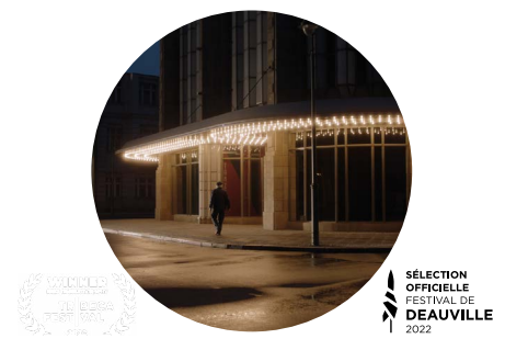
THE WILD ONE BY TESSA LOUISE-SALOME

DUGONG FILMS - EAGLE PICTURES • ITALY -SWEDEN • 58' & 80' • 2021