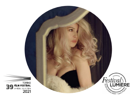
THE GIRL IN THE FOUNTAIN BY ANTONGIULIO PANI771

NOCTURNES PRODUCTIONS - GIRELLE PRODUCTION - ADV PRODUCTIONS • FRANCE - BELGIQUE • 52' & 70' • 2023