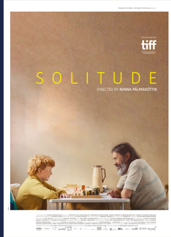
SOLITUDE BY NINNA PÁLMAÐÓTTIR