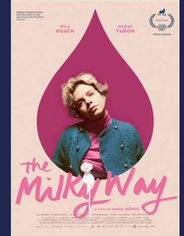
THE MILKY WAY BY MAYA KENIG