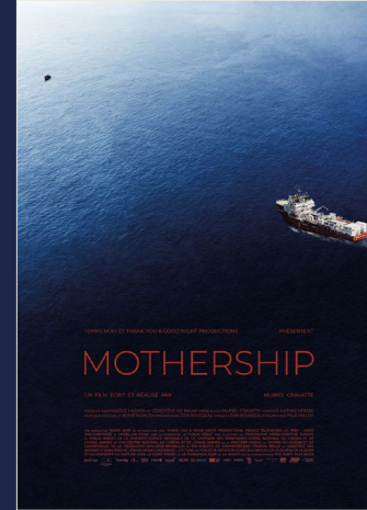
MOTHERSHIP BY MURIEL CRAVATTE