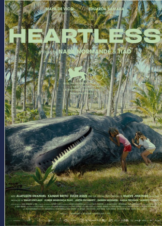
HEARTLESS BY NARA NORMANDE & TIÃO